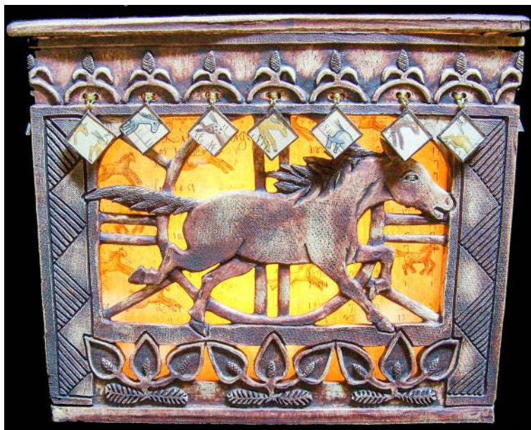
"Box Of Horses"