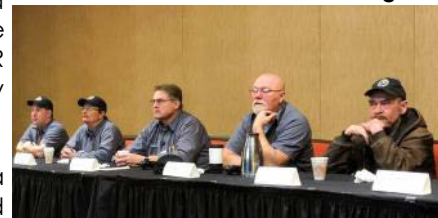
LRCR Maintenance Team at Arc Flash Training