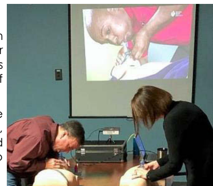
Morton Salt Team at CPR Training