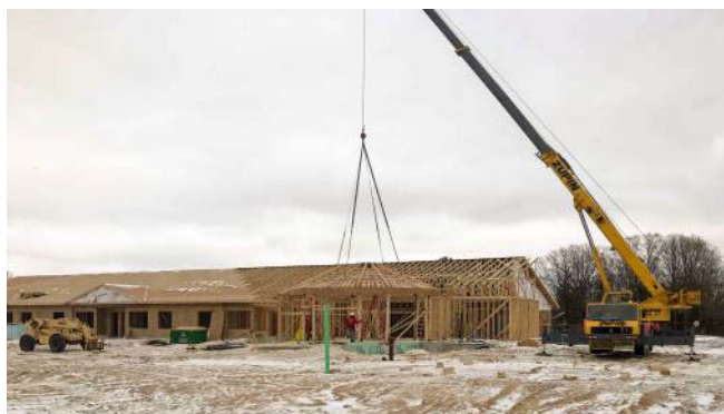
Elders complex on schedule for August 2019