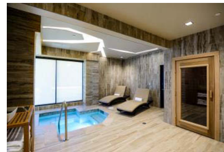
Women's Sauna and Steam