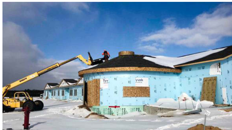
February 18, 2019 Elders Complex Front Entry