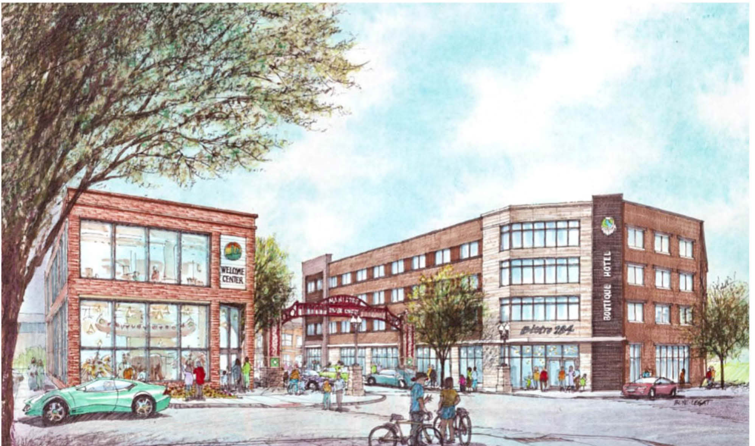
Manistee downtown entrance at US-31 and River St., plans include; a welcome center and boutique hotel.