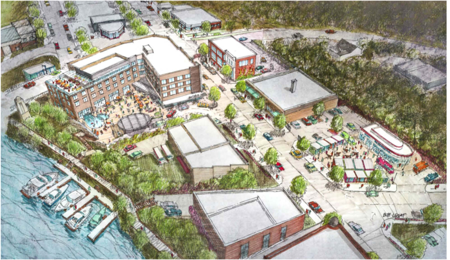
Spirit of the Woods Manistee Gateway Project: the project spans from US-31 to Division St.