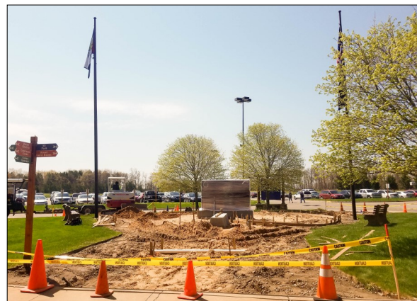
Construction for the new memorial stone underway at Little River Casino Resort

For information please contact Kathleen Bowers at 231.398.6845