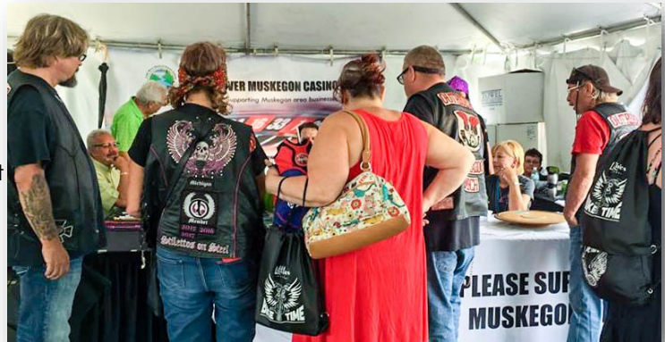
The LRBOI Government Center booth at the Muskegon Bike Time event, July 2018