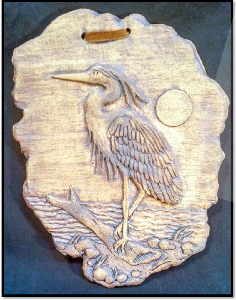
Great Blue Heron (wall hanging)

Shirley Brauker | 260.243.9027 | sbrauker@gmail.com www.moonbearpottery.com www.facebook.com/moonbearpottery/